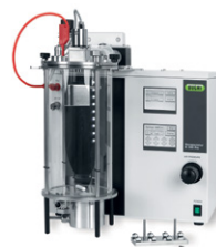
Encapsulator B-395 Pro

Spray Dryer for small samples and particles