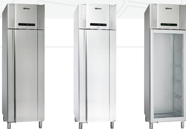
The BioPlus 500 is available as a refrigerator or freezer in either white or stainless steel finish. All BioPlus models come with self-closing door. Glass door is available for refrigerator.

In terms of performance, these units are designed to provide the very best results even under exceptional conditions. The BioPlus utilises environmentally responsible HFC-free foam propellants and is available with HFC-free refrigerants.