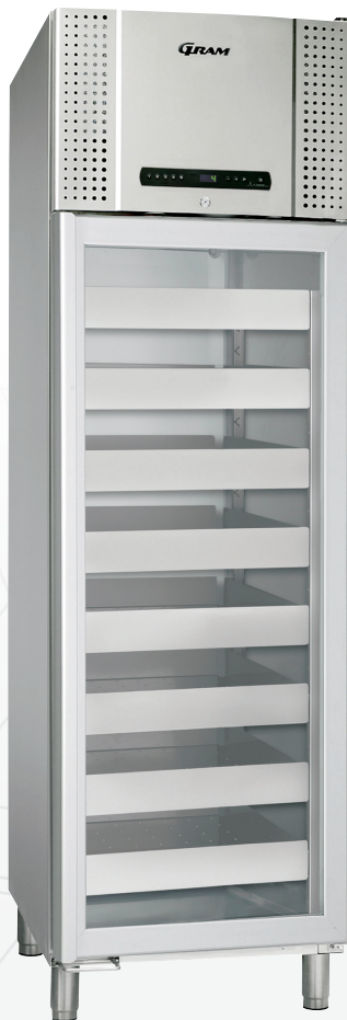
BioPlus 500. Drawers and glass door are optional extras.

The BioPlus 500 range is designed for the storage of the most delicate biomaterials, in situations where even tiny fluctuations in conditions inside the storage cabinet can have a serious effect on the contents.