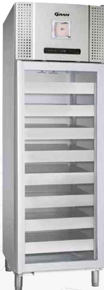
BioBlood BR660D. Drawers and chart recorder are optional extras.

The BioBlood 600/660 design is customised to meet the special requirements associated with the controlled storage of blood, plasma and blood-related products.