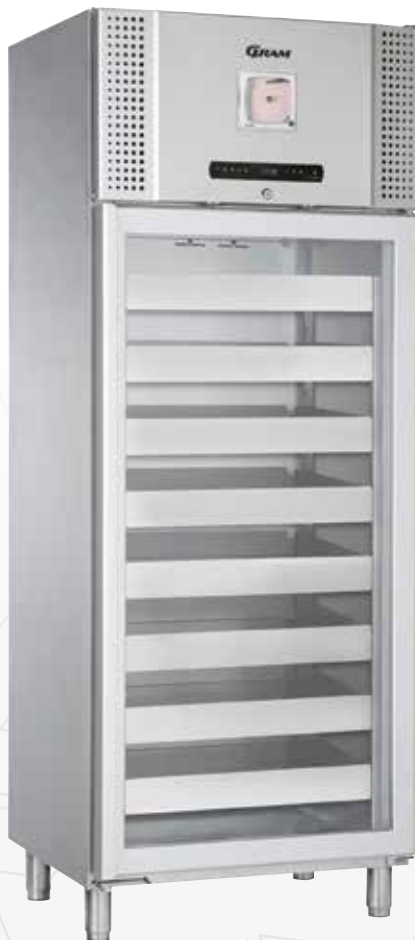
BioBlood BR660W Drawers and chart recorder are optional extras.

The BioBlood 600/660W design is customised to meet the special requirements associated with the controlled storage of blood, plasma and blood-related products.