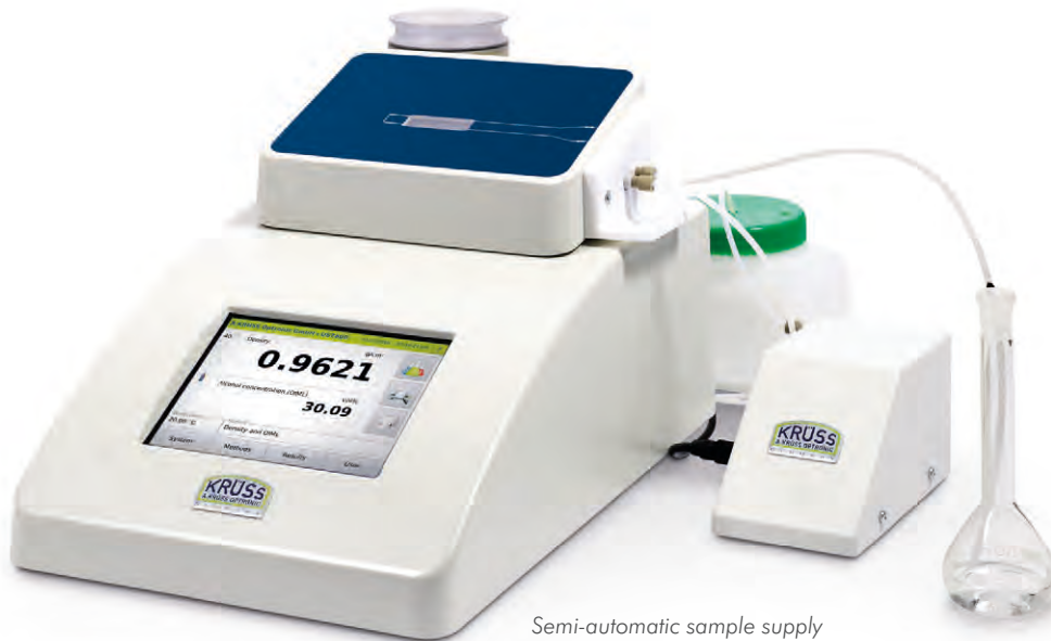
Semi-automatic sample supply with DS7800 via peristaltic pump DS7070