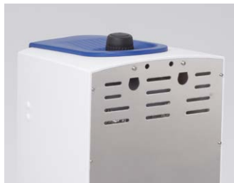
Wall bracket set for wall mounting Elmasteam 4 5 basic