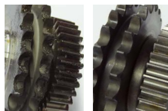
Removal of grease, oil and swarf