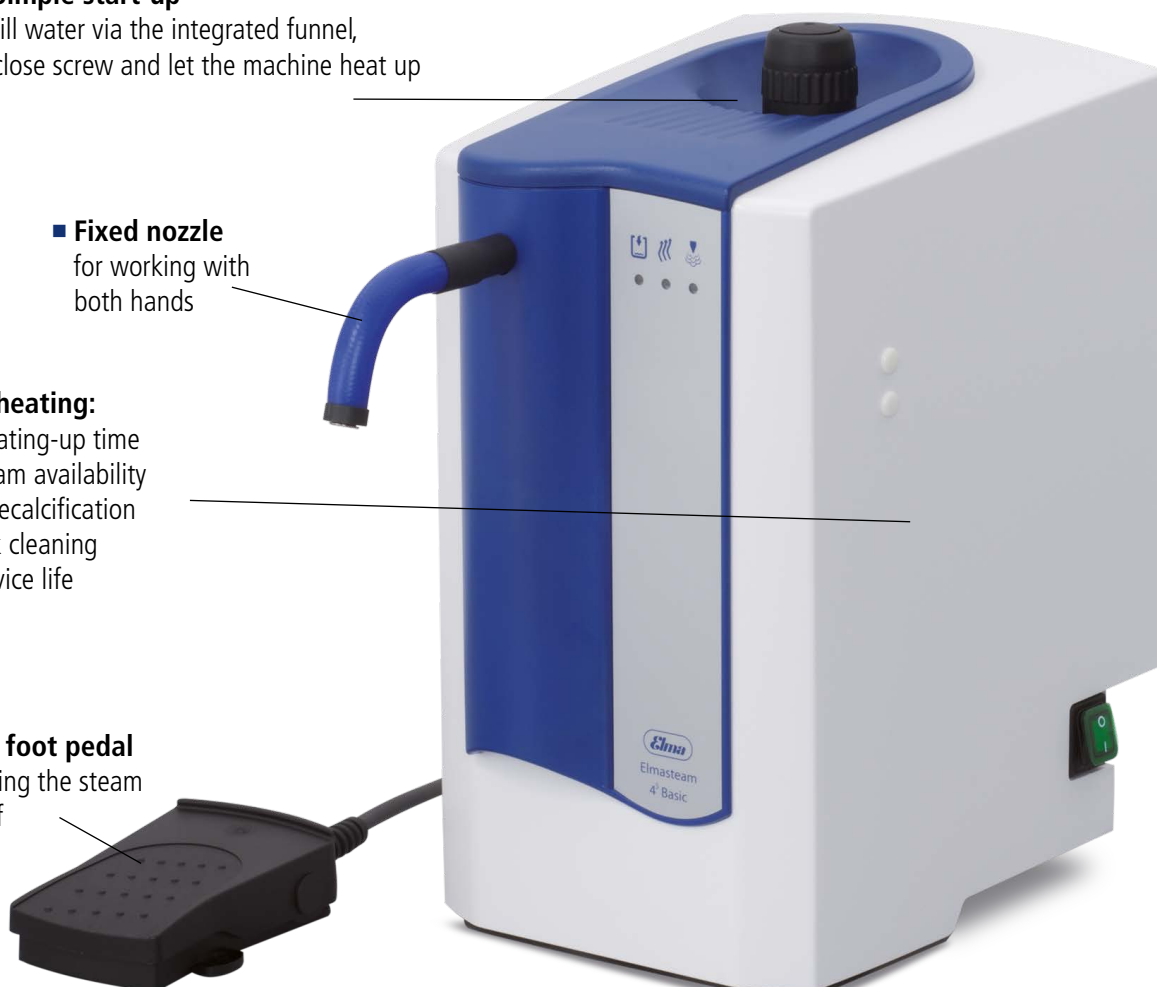
Elmasteam 4 5 basic