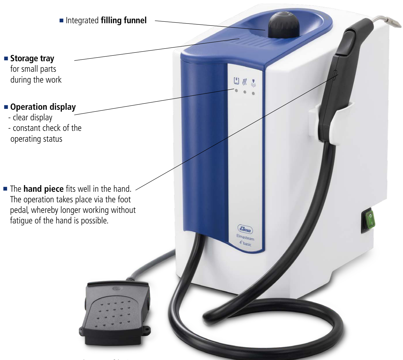
Elmasteam 4 5 basic HP

With the flexible hand piece components and parts can be steam cleaned all around quickly and effectively.