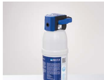
Water filter cartridge by Brita