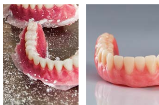
Cleaning of dental prostheses